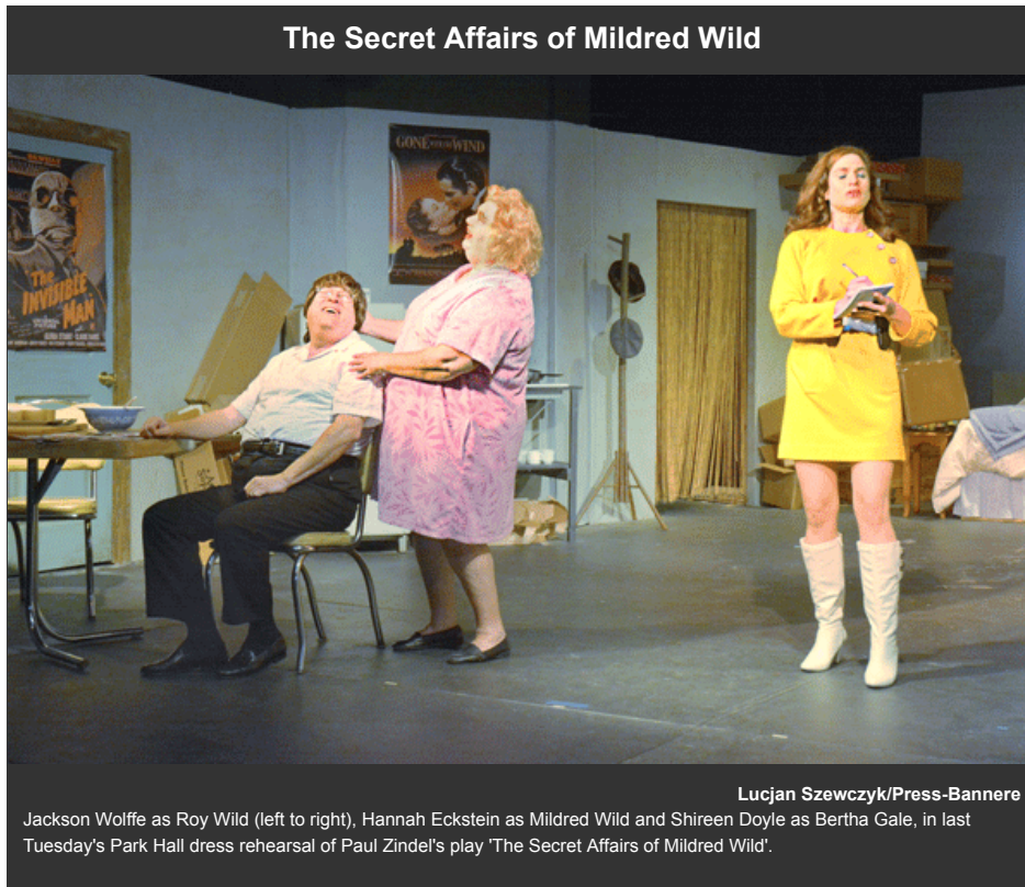
The Secret Affairs of Mildred Wild